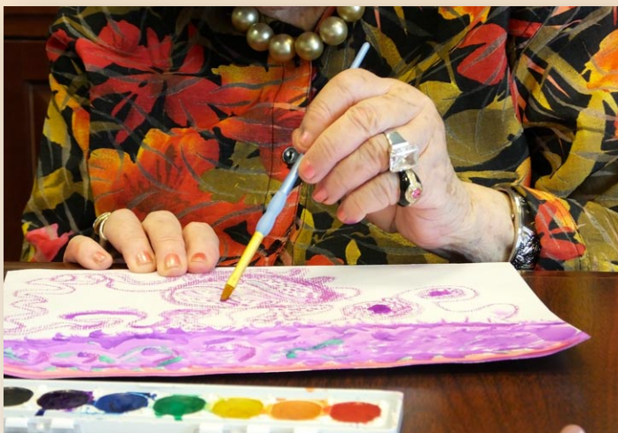
The Arts Fusion Program works with Alzheimer patients through creative expression.