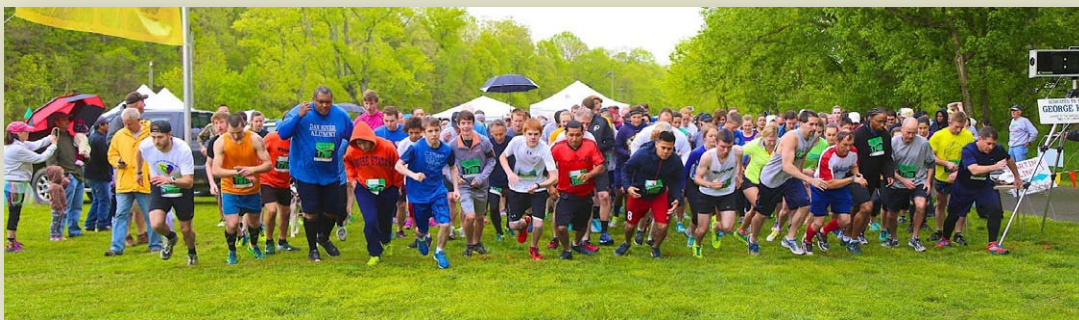
A large crowd of runners and walkers supported the Dan River Autism Awareness 5K even on a rainy morning.