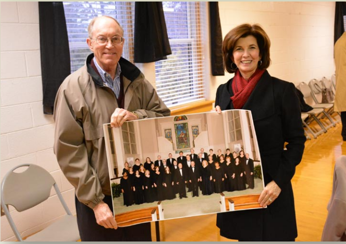
Danville Area Choral Arts Society is excited for another great season.