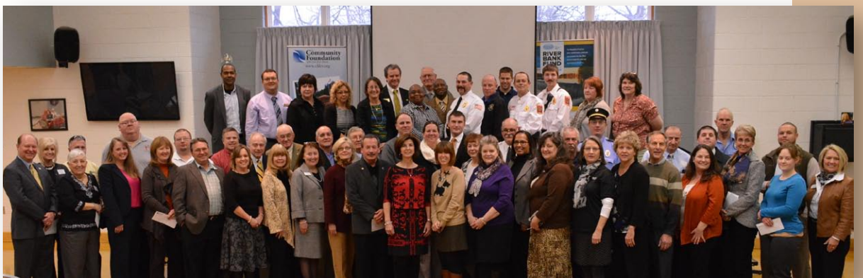
Dozens of area nonprofit agencies received grants of more than $626,000 at the Grant Reception.

Bassett Memorial United Methodist Church Berea College Boy Scouts of America/ Blue Ridge Council Boys & Girls Clubs of the Danville Area Buffalo Baptist Tabernacle City of Danville - Veterans Memorial Clarksville Regional Museum Clover Cemetery The Community Foundation Danville Cancer Association Danville Community College Danville Life Saving and First Aid Crew Danville Public Library First Baptist Church Free Clinic of Danville Garden Club of Danville God's Pit Crew God's Storehouse Grace Design United Methodist Church House of Hope Longwood University Martinsville Cemetery Fund Mecklenburg County Cancer Association Moffett Memorial Baptist Church Mt. Hermon Baptist Church Youth Missions Mt. Vernon United Methodist Church New Community of Praise SPCA of Pittsylvania County Salvation Army Southside Virginia Community College Nursing Program St. Peter's Greek Orthodox Church Temple Beth Shalom Transitions Pregnancy Solutions United Negro College Fund