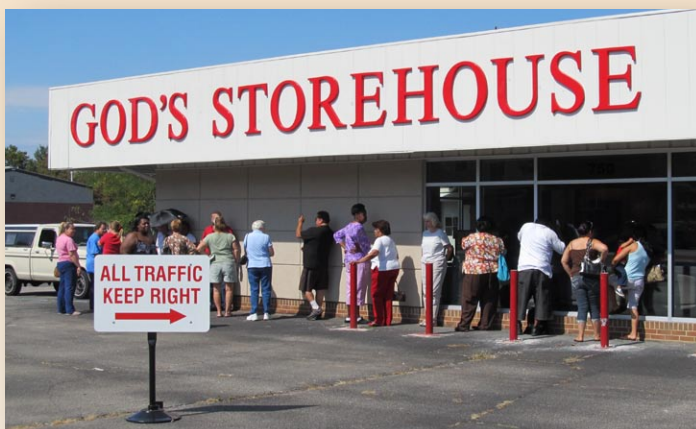
God's Storehouse distributes food to those in need in Danville and Pittsylvania County.

Keeling Volunteer Fire Department - to purchase a Kubota RTV1140CPX utility vehicle, a FS-60 custom built lightweight foam unit and an enclosed 8'x24' trailer, $10,000.