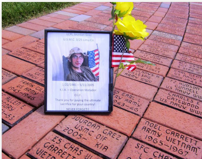
The Memorial Walkway of the Danville Pittsylvania Veterans Memorial recognizes persons who served honorably.

Schrum Family Fund of Triangle Community Foundation