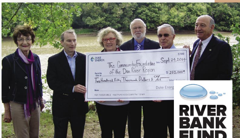
Community Foundation Board Members accept a Duke Energy donation to the RiverBank Fund.

The Community Foundation of the Dan River Region is a public 501c3 charity that serves a region from Martinsville/Henry County through Mecklenburg County in Virginia as well as the neighboring North Carolina counties. The footprint of the Foundation and its experience in administering grant funds allowed the RiverBank Fund to be established quickly and efficiently.