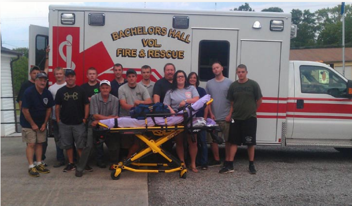
Bachelor's Hall Volunteer Fire Department is proud of their new Stryker Power Pro stretcher.

Danville Symphony Orchestra - to present two concerts "Witches and Goblins" and "Santa Claus is Coming," $500