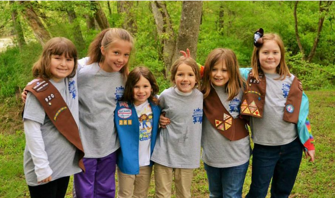
The Dan River Autism Awareness 5K always bring together family and friends.