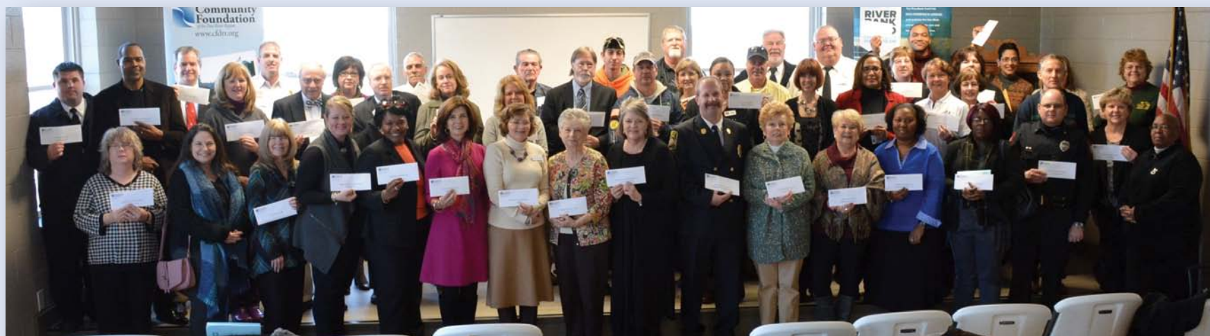
Dozens of area nonprofit agencies received grants of more than $641,000 at the Grant Reception.

House of Hope Longwood University Martinsville Cemetery Fund Mecklenburg County Cancer Association Moffett Memorial Baptist Church Mt. Hermon Baptist Church Youth Missions Mt. Vernon United Methodist Church New Community of Praise, Inc. Salvation Army Southside Virginia Community College Nursing Program St. Peter's Greek Orthodox Church Temple Beth Shalom Transitions Pregnancy Solutions United Negro College Fund