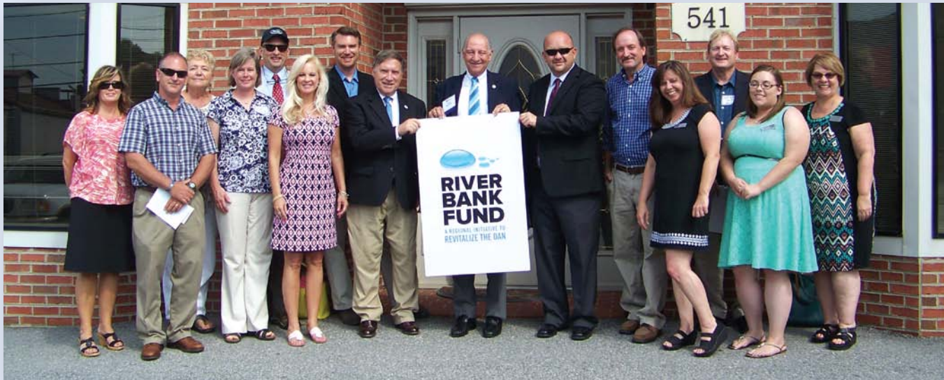
Organizations across the region received support totaling $237,500 in the first round of RiverBank Fund grants.

Yanceyville Volunteer Fire and Rescue - to purchase pagers and radios for fire fighter and first responder personnel, $10,000.