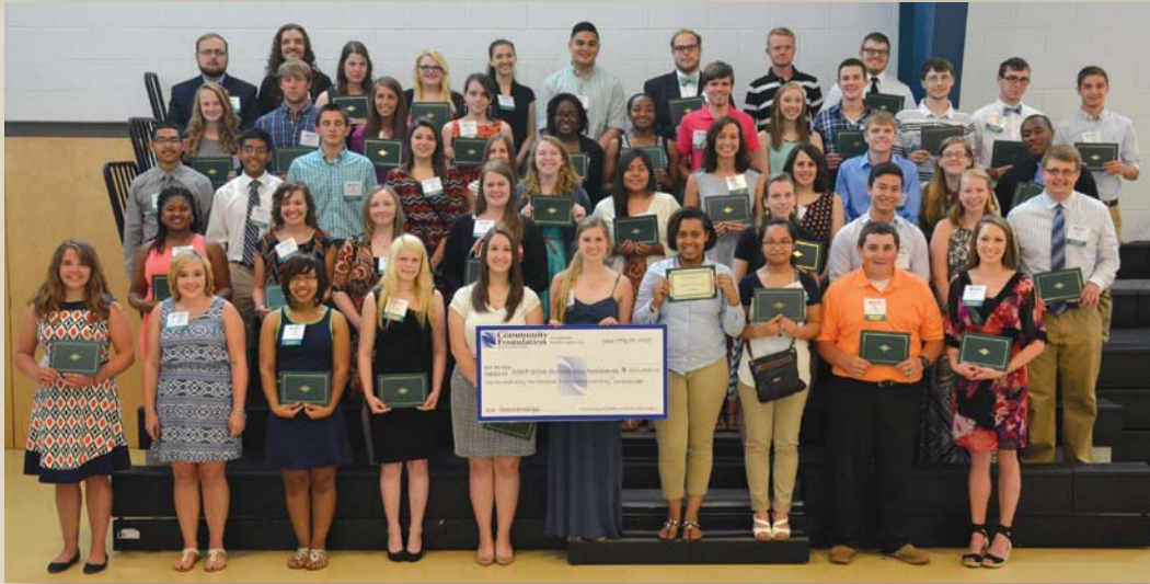
80 scholarships were awarded to area students totaling $153,400 for the 2015-2016 school year.