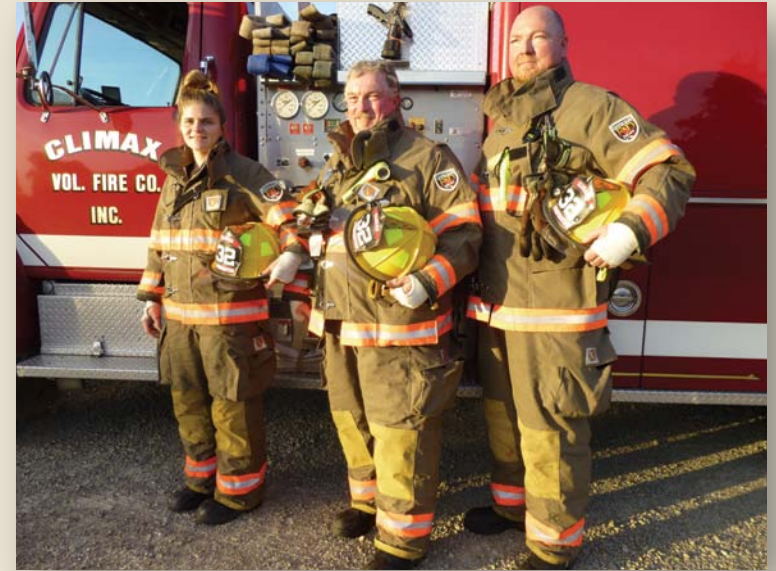
Members of the Climax Volunteer Fire Department proudly wear their new gear.

Danville Area Humane Society - to make financial assistance available to provide emergency treatment that will give companion animals a chance to remain family members, $650.