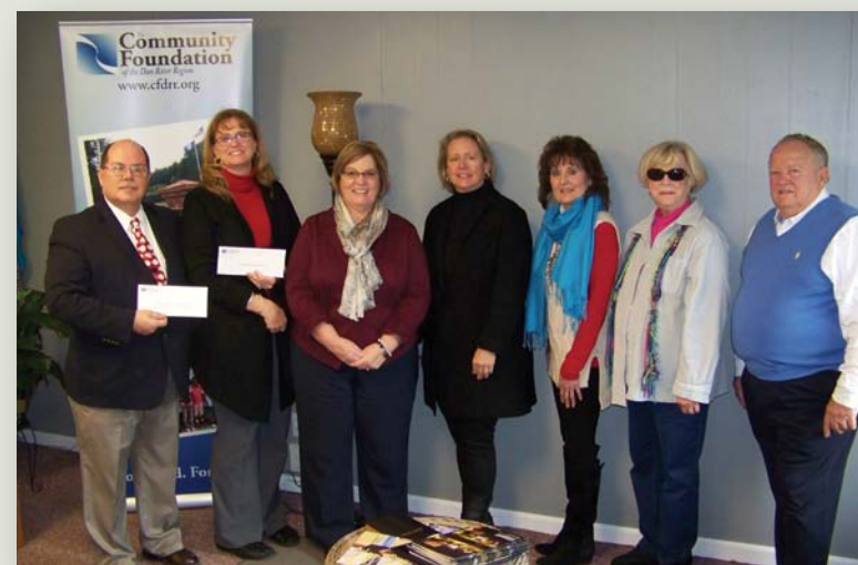
The Fund for Halifax County awarded its fourth round of grants, thanks to the work of the Halifax County Advisory Committee. Main Street United Methodist Church - Jane Jones Food Pantry received $1,150 from the Fund for Halifax County and Halifax County Cancer Association received $500 from the South Boston Medical Fund.

Locust Hill United Methodist Church - to purchase a 49-cubic-foot double-door freezer to store frozen items for their food distribution program, $3,032.