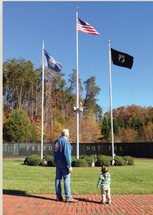
Bricks are still available to honor veterans at the Danville-Pittsylvania Veterans Memorial.