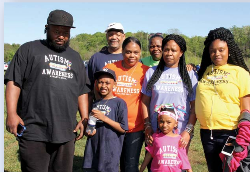
The Dan River Autism Awareness 5K brings together family and friends.