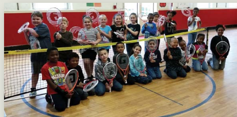
QuickStart Tennis is incorporating tennis into area schools' curriculum.

Reach Out and Read Carolinas - to purchase age and developmentally appropriate books which serve as the backbone